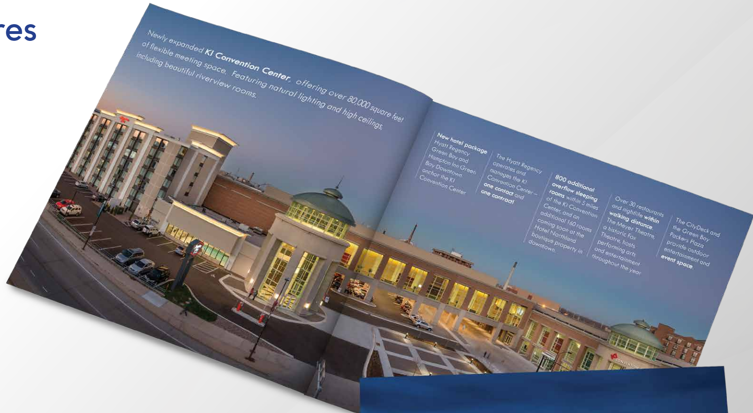
KJ Convention Center promotional brochure Meeting promotion for Green Bay Visitors and Convention Bureau